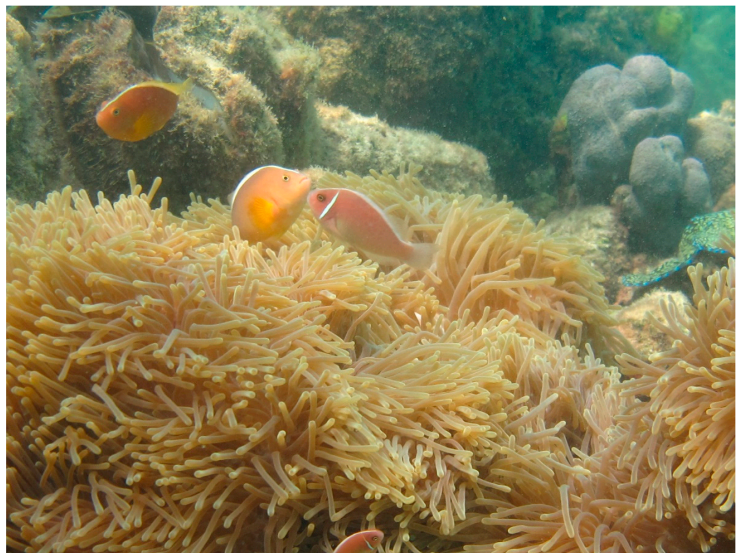
Figure 1. Skunk anemonefish ( Amphiprion akallopisos ) and pink anemonefish ( Amphiprion perideraion ) sharing the magnificent sea anemone. The primary difference in coloration between skunk and pink anemonefish is the vertical white head bar behind the eye of the latter species.

Copyright: © 2021 by the authors. Licensee MDPI, Basel, Switzerland. This article is an open access article distributed under the terms and conditions of the Creative Commons Attribution (CC BY) license ( https://creativecommons.org/licenses/by/4.0/ ).